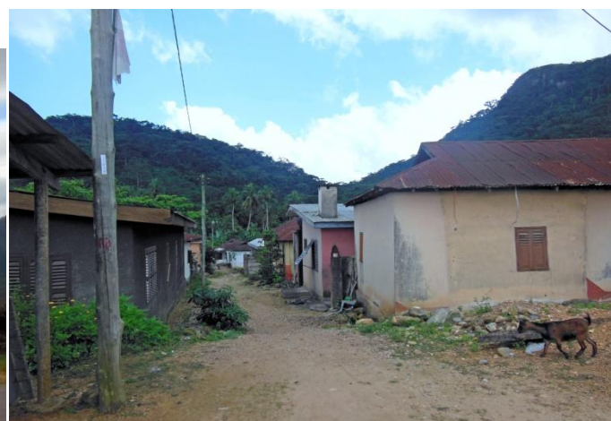
Hills north of Ho, Village and Ball Float seller