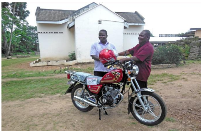
The new motor bike and proud owner! Cathedral, shuttered after the Celebrations